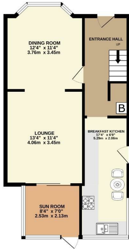
GROUND FLOOR 562 sq.ft. (52.2 sq.m.) approx.